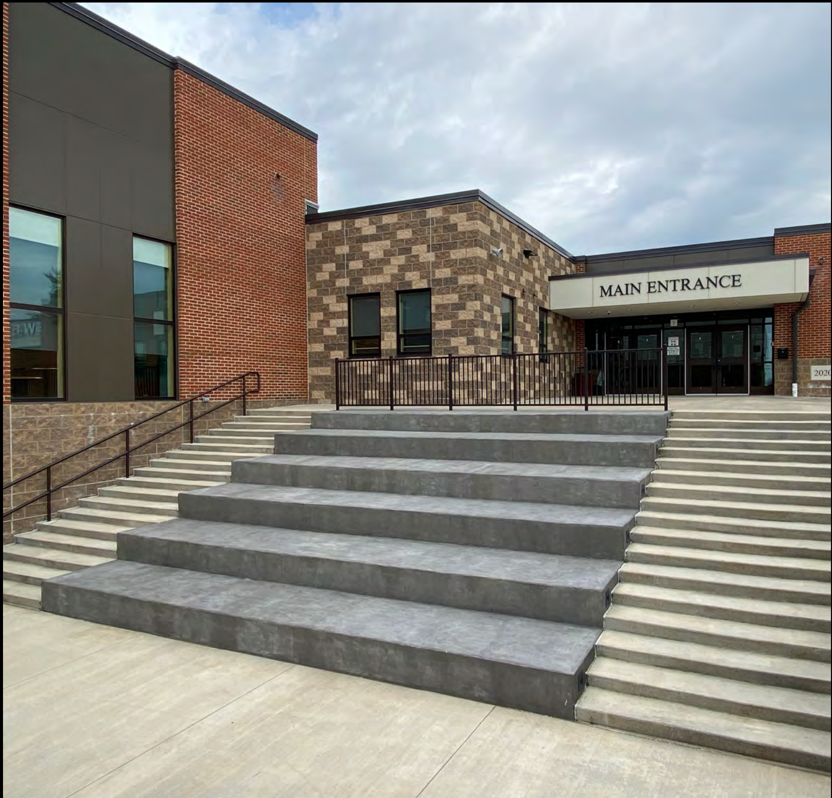
Outdoor spaces were designed for gathering and learning.